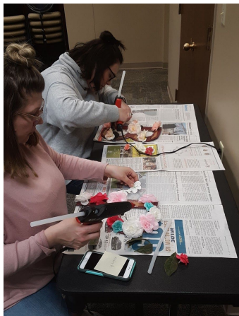
Floral wall monogram in progress