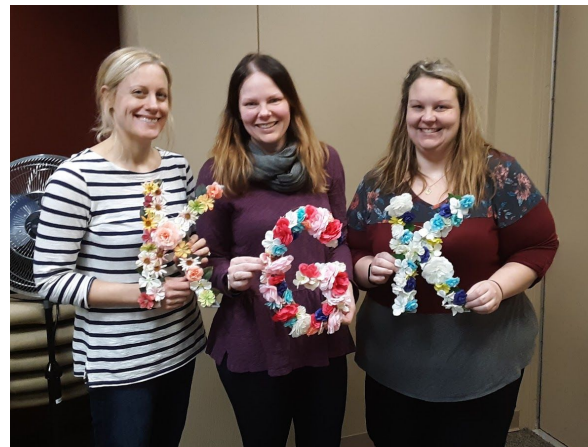
Floral wall monogram finished product