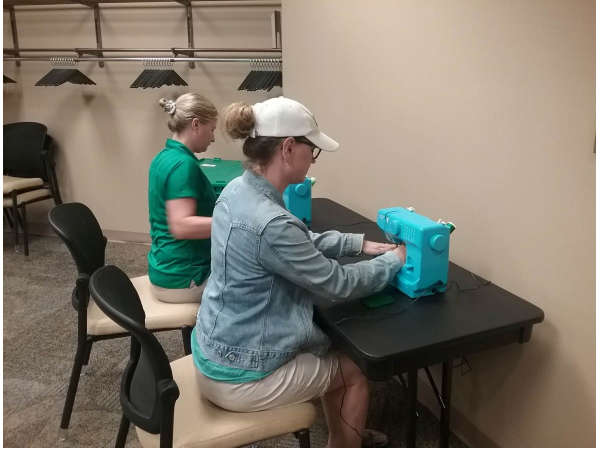
Cactus pin cushions in progress