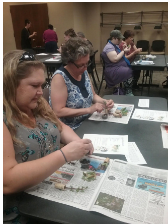
Succulent cork magnets in progress