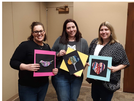
Magazine art finished product