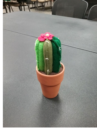
Cactus pin cushions finished product