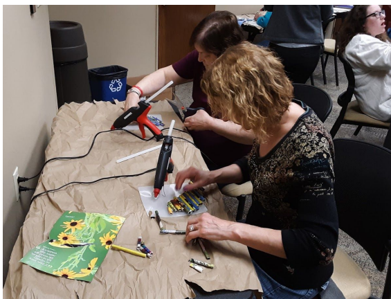
Magazine art in progress