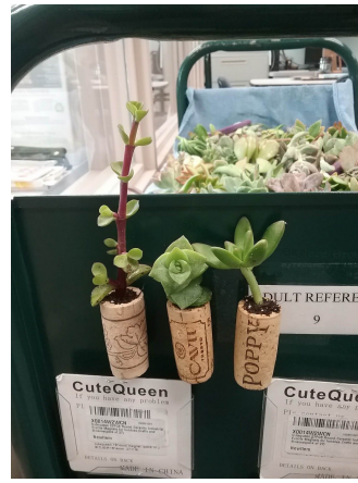
Succulent cork magnets finished product