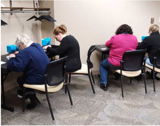
Rice hand warmers in progress